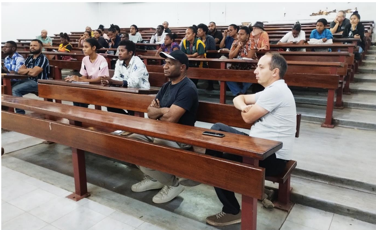
Photograph 2: Participants listening to one of the Weekly SHSS Seminar presentations