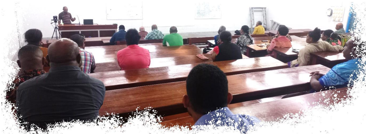
Photograph 1: Participants at a Weekly SHSS Seminar

Table 2 below shows the publications and presentation across different strands in the School.